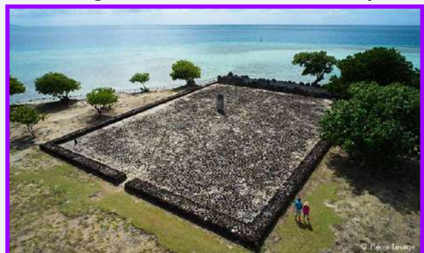
Māori origins, voyaging and adaptation Produced by Paul Tucker@Orewa College (2023)