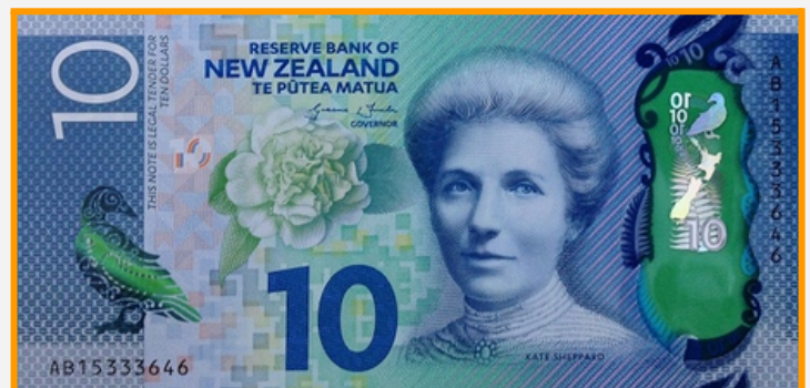
Kate Sheppard appears on the New Zealand $10 note. Can you think of another female that is on New Zealand currency?